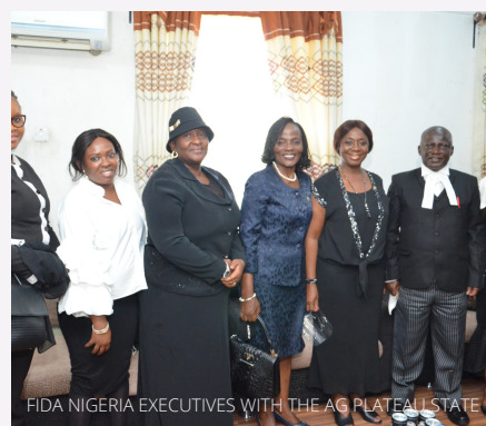
FIDA NIGERIA EXECUTIVES WITH THE AG PLATEAU STATE