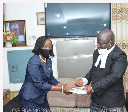
CVP FIDA NIGERIA WITH THE AG OF PLATEAU STATE